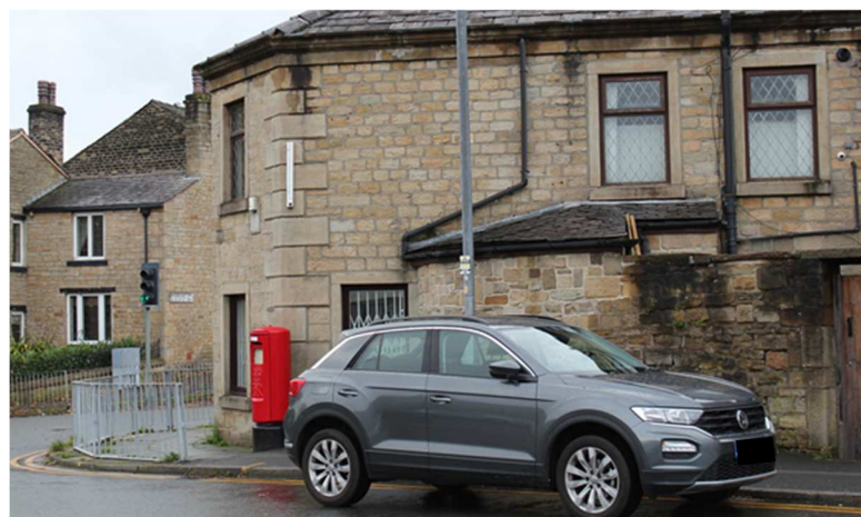
Parking on double yellow lines outside the Post Office on Walmersley Road